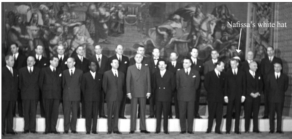
Fig. 10: General de Gaulle, Prime Minister Michel Debré and the members of his government, 10 January 1959.

Nafissa Sid-Cara is seen as no more than a puppet, albeit an elegant one, manipulated and silenced by the government. Only her pretty white hat reveals her hidden presence in the official picture of the 1959 government.