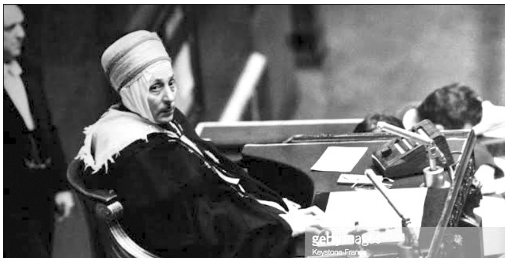
Fig. 17: Boualam presiding the National Assembly in Paris, on 23 January 1959.