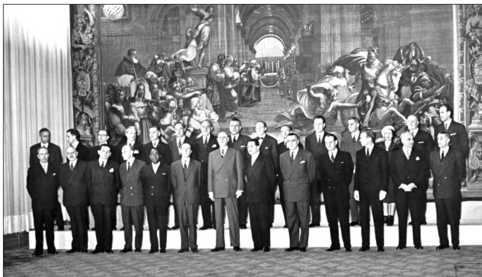
Fig. 11: Same government, different angle.

She is yet more visible in a photo taken by the media: