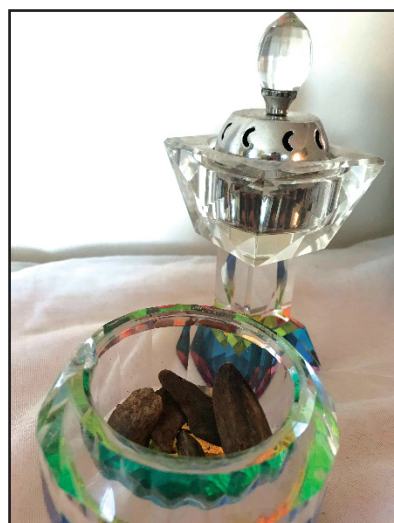
Fig. 2: ‘ ūd al qamārī