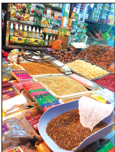
Fig. 1: ḥarmel seeds