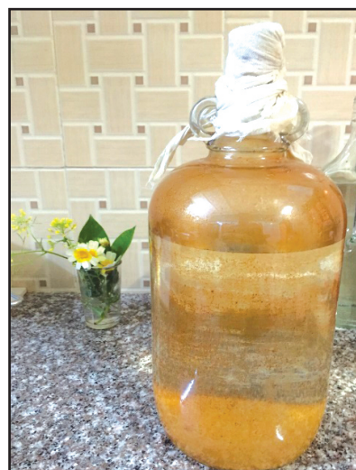
Fig. 4: Orange blossom hydrosol