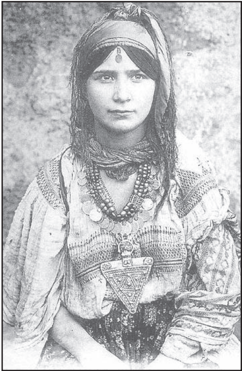
Fig. 1 : Image on the left: Pillow cushions with postcard images of women, Marrakesh 2019. Image on the right: postcard Femme juive de Debdou reproduced in one of the cushions in the image on the left, (Author's collection).