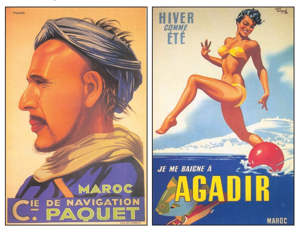
Fig. 4: Two Paquet Posters highlighting tradition and modernity.

Paquet poster became central to the commercial mission of the company as well as the development of tourism in Morocco after 1918.