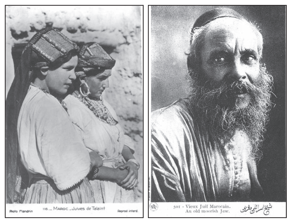
Fig. 2 : Image on the left: Postcard of Jewish women, Talaint. Image on the right: Postcard of an Old Moorish Jew, (Credit Paul Dahan).

Jews and Jewish women in particular. Influenced by colonial discourse of ghettoized North African Jews, the cameras of Marcelin Flandrin and Lévy Frères constructed Jewish/Hebraic types and specimens expanding the Orientalist European idea of Jewish captives of mellāḥ-s throughout Morocco.