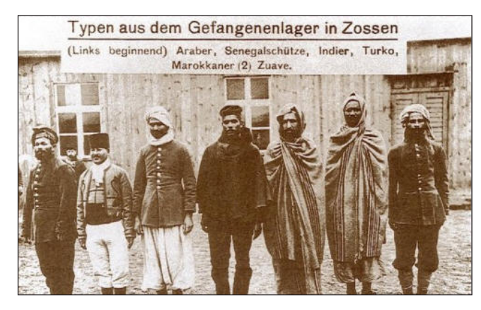
Types from the Prison Camp in Zossen: (Starting from the left) Arab, Senegalese, Indian, Turk, Moroccan (2), Zouave. (http://sirkukri.blogspot.com/2015/09/prisoners-from-faroff-land-indian.html)

The choice of India, Indo-China, and North and West Africa is very important for the Germans to launch their own version of war plans. Perhaps the notion of Pan-Arabism was not a motivating cause to fight against the Germans for people of the Punjab, Bengalis, the Chams, <sup>18</sup> Africans in the Savannah region, and Berbers in North Africa. I would like to draw attention to the fact that these areas revealed and are still revealing countless numbers of non-Arab Muslims, a significant characteristic that the Muslim Turks fully enjoy in Turkey. 14 November 1914 was a crucial day when Sheikh-ul-Islam in Istanbul avowed "jihād" on behalf of the Ottoman government, urging Muslims all over the world—including in the Allied countries—to take up arms against Britain, Russia and France." The idea might seem awkward to some extent, causing many questions among which: if Britain, Russia and France are the enemies of Islam, where can Muslims categorise other countries like Portugal and Greece, Norway and Spain?